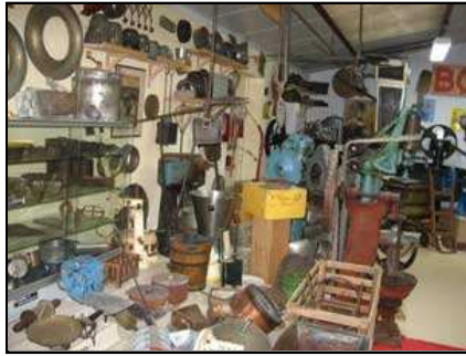
In the Bread Museum in Fismes, France, Mr Boizard collected everything to do with bread under one roof!

in World War I the Germans machine-gunned the blades off the windmills because the French Resistance used them to point out where enemy bunkers were hidden and munitions stored.