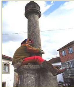
Festivals Around the World