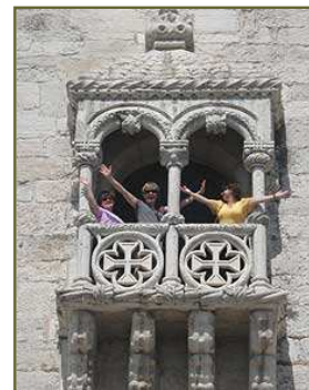
Find Cool Lodgings