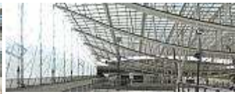
Paris - It's more than just an airport.